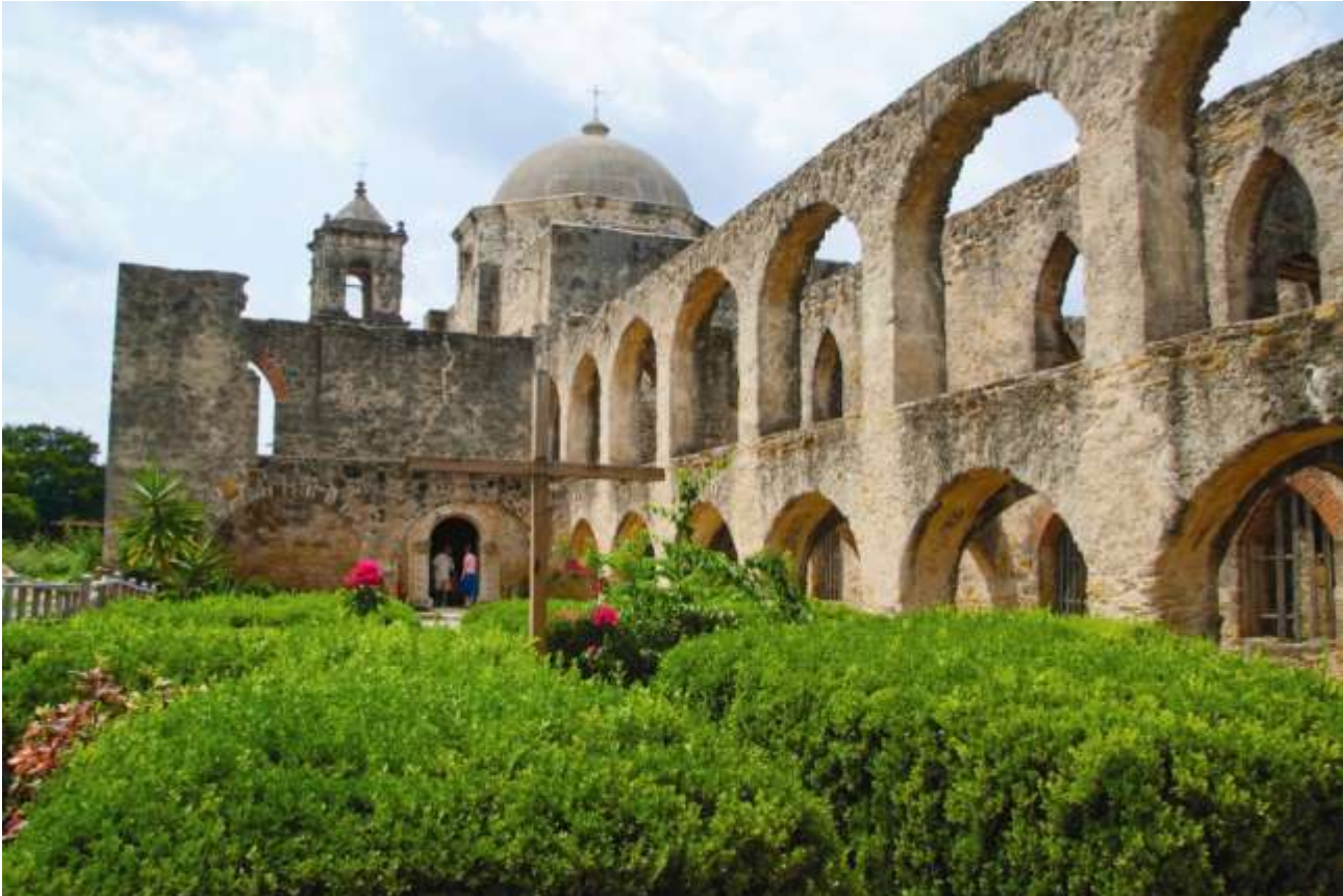
^ Alamo A Piece of History